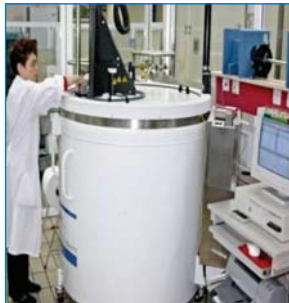
Cord Blood Stem Cell Bank