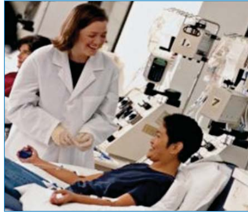
Sir Charles Clore Hostel