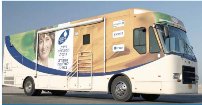
Mobile Mammography Unit